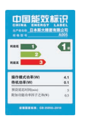
Level 1 Save Energy